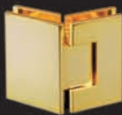
HINGE TYPE: 135° Glass to Glass