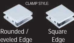
CLAMP STYLE: Rounded / Beveled Edge