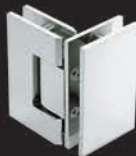
HINGE TYPE: 90° Glass to Glass