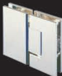
HINGE TYPE: 180° Glass to Glass